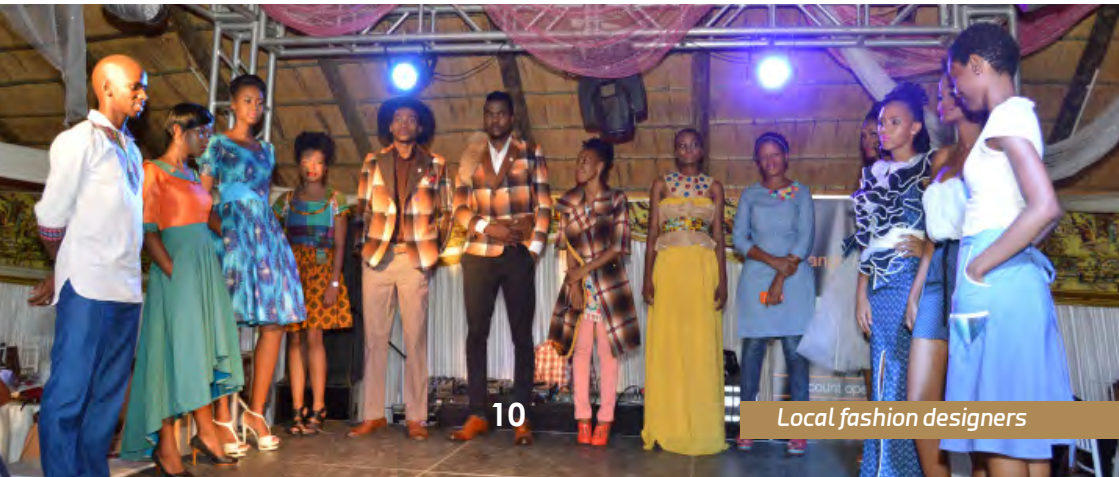
Local fashion designers